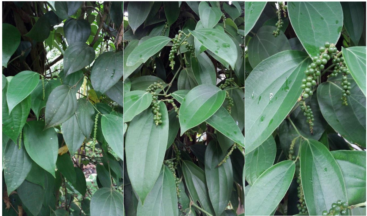
With the South West Monsoon showers continuing for over two months, berry setting has started in South India. [Photographs taken in Kerala, India, August 2020]